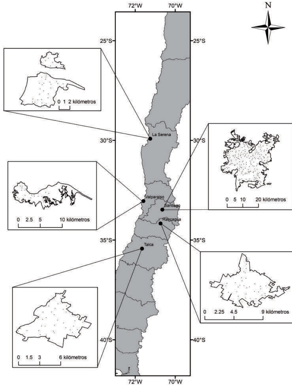
FIGURE 1. Political map of Chile showing regional division, and close up to the area of central Chile including the cities sampled in this study. / Mapa político de Chile mostrando la división regional administrativa y la ubicación de las cinco ciudades estudiadas.

Additionally, we wanted to assess the incidence of the native and exotic species in the studied cities. We calculated incidence as the number of plots in which the species occurred divided by the total number of plots. This was studied as a function of their biogeographical origin, i.e. native and exotic species. A Kolmogorov-Smirnov test was performed in order to assess the significance of the differences in the incidence between native and exotic species.