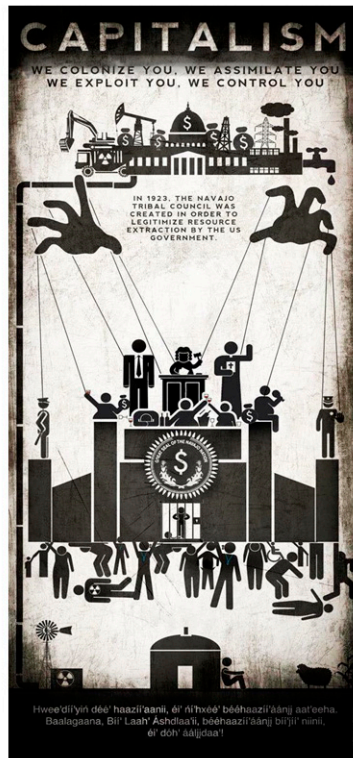
Illustration 2. This image appeared in social media and in the streets around the Navajo nation in response to the three-years lease extension the Navajo government gave to Peabody Company. July 2017.

These decisions have direct impacts on the daily life in the Navajo nation.