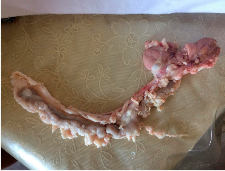
Illustration 3. View of part of the sheep with many tumors. Two women butchered the sheep in order to be eaten during the construction of a hogan, a traditional Diné house in Colorado, August 2017, Greasewood.

Both pictures depict tumors found in a sheep we had butchered a few hours before. According to the Diné environmentalists, this is more and more common. The animals drink water that is contaminated by uranium. Sheep are an essential part of the traditional Diné life. The Diné eat the meat and can sell the wool or use it to weave blankets. Butchering is also an occasion to gather- it has a social function. Sheep allow the Diné to participate in the global economy without leaving their land or engage in wage-based activities. Nowadays, sheep are eaten on special occasions and during ceremonies. They are highly respected and cherished. Sheep ( "dibé" in Diné Bizaad) are like a member of the family. They are also a traditional food.