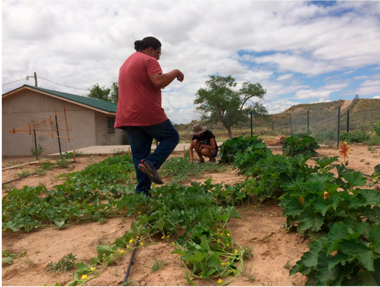
Illustration 4. two diné farmers in a community garden in Greasewood, Summer 2017: in the community garden of Greasewood where they planted vegetables and organized teachings. The community garden is just outside the chapter house. Everyone can go, water it and take vegetables. The farmers are not paid to provide these teachings, they believe that by showing the way and involving people, Diné people will go back to growing their food and restore their health.