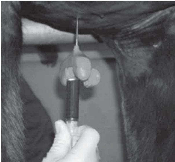
Figure 2: Aspiration of bone marrow technique from the sternum (Kasashima et al 2011).

Técnica de aspiración de medula ósea desde esternón. (Kasashima et al 2011).